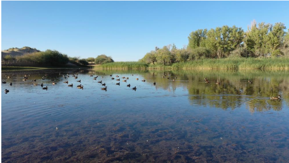
Wetland and populus euphratica forest in Layisu Village, Kunyu City, Xinjiang

collected in small ponds. Excess water drains from the passage and is collected in a wadi in the park. The delayed discharge of water ensures the system is not overloaded during heavy rainfall. Due to the compact footprint of Forest Bath, there is a lot of unpaved soil enabling water infiltration and buffering, reducing heat stress on hot days. The green passage consists of various forest plants, increasing biodiversity. Flowering plants climb up along cables and nesting boxes for animals are included on the tree trunk columns.