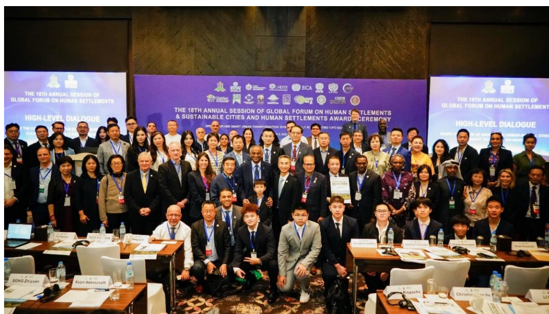
Distinguished speakers and youth at GFHS 2023

Major partners showed continuous engagement with this year’s forum which brought together more than 300 professional participants representing 40+ countries. 20 leading organizations joined GFHS 2023 as co-organizers and collaborators. More than 40 outstanding individuals contributed to the forum discussion, including senior officials from relevant national governments, UN agencies and other international organizations, city mayors, business leaders, well-known experts and scholars, among others.