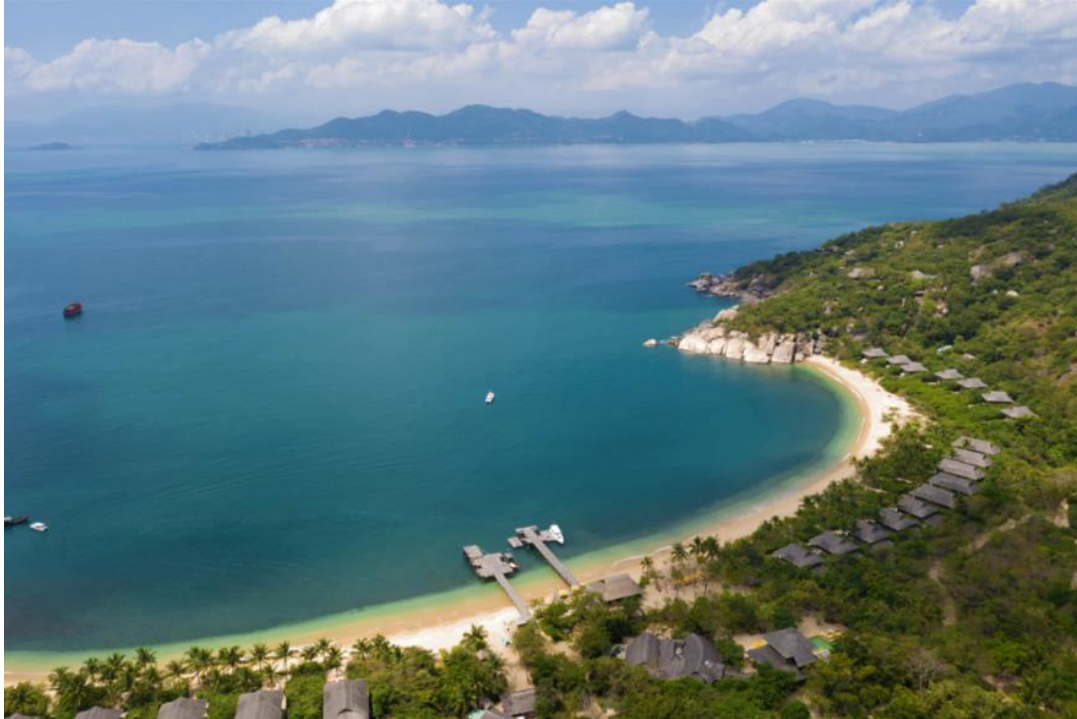
Six Senses Ninh Van Bay