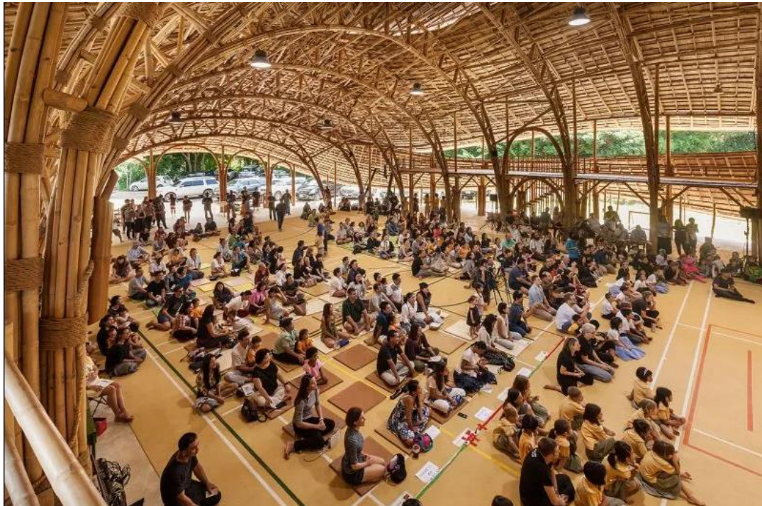
Bamboo Sports Hall at Panyaden International School

In this project for the first time large engineered prefabricated bamboo trusses without any steel reinforcements were designed to create big span arches. The trusses and their connections were calculated by engineers to withstand all prevailing load and shear forces such as high-speed winds, storms and earthquakes. This innovative combination has opened endless possibilities for bamboo to be used in mainstream construction which could lead to a substantial reduction in CO2 pollution.