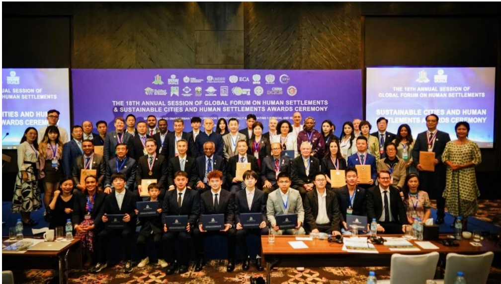
Awarders and Awardees at Sustainable Cities and Human Settlements Awards 2023