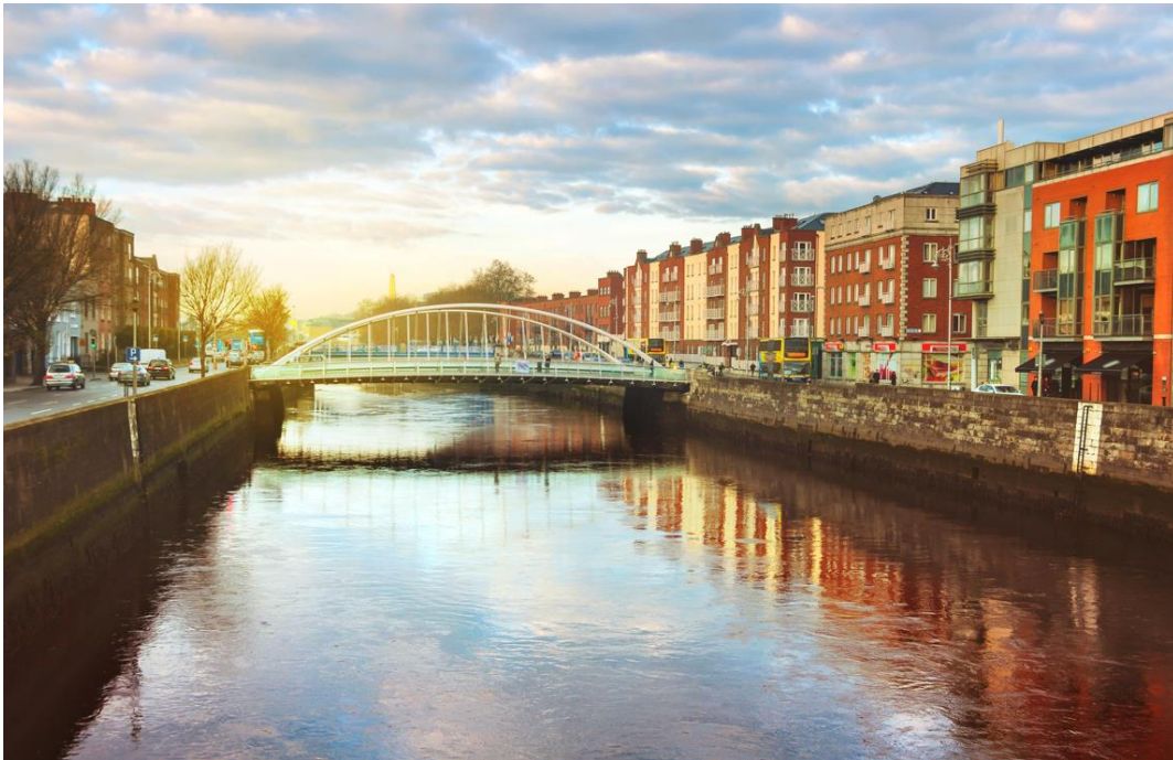
River Liffey, Dublin

sets to inform how we take action and continue to make Dublin resilient. (More: http://www.dublincity.ie/ )